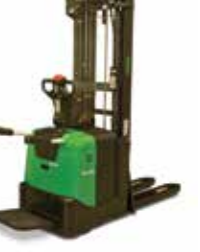
S212L - 214L

⚠ 1.2t - 1.4t ↑ 4755 mm 🔋 24V / 300 Ah ⓘ Elevating support arms. Optional operator platform available.