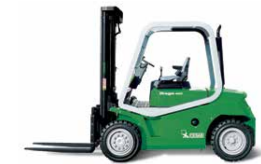
Drago 400 - 450 - 500