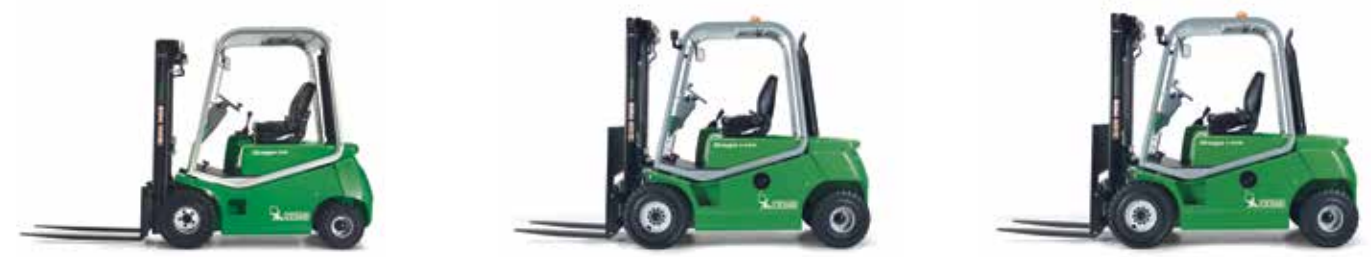
Drago 150 - 180 - 200